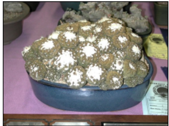
One of Woody's Many Winners: Copiapoa hypogaea