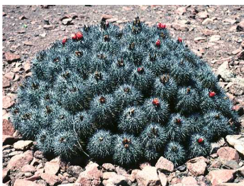
C. desertorum in habitat