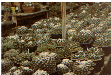
Ariocarpus at "Cactus Data Plants"