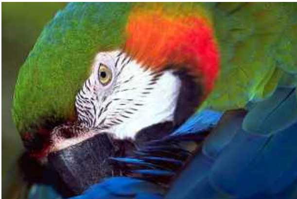
Upclose and personal...