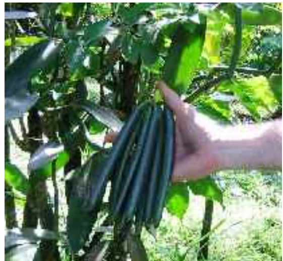
Vanilla Beans on the Vine