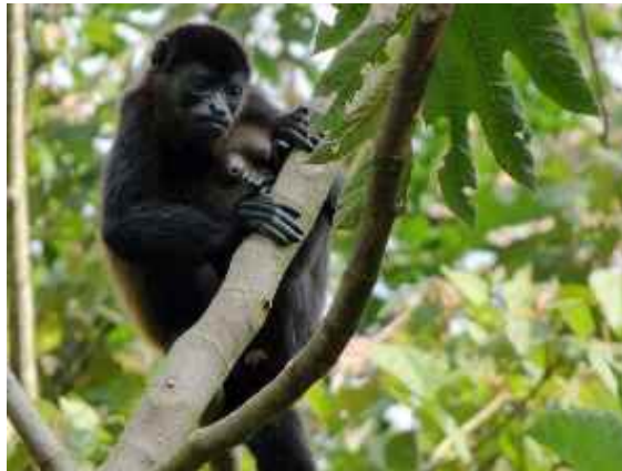
Howler Monkey (...I think!)