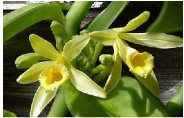
Vanilla Orchid Flower – Vanilla planifolia

2nd Rev. Edition, 2009. With over 10,000 entries, the new Baja Almanac lets you pinpoint any location in Baja, down to the most remote ranch or campsite. Includes updated land routes and cultural features. There are complete indexes, a mileage chart, and primary route distances in both miles and kilometers. There is also an adjoining map overlap—each map displays an overlapping segment of adjoining map pages. 48 color maps, 22 pages, 10-3/4” x 15-1/4”, printed on 70# paper with matte finish for a crisper, more defined presentation and longer lasting. Staplebound. “Don’t go to Baja without it”. Retail for: $24.95