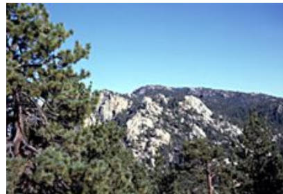
Not all of Baja is desert!!!

Current collections-based curatorial and research projects on the flora of Baja California being conducted by the San Diego Natural History Museum such as the Baja California vascular plant checklist project, data entry and georeferencing of specimens deposited in the SD Herbarium, and the digitization of plant photographic slides and prints in the Museum’s botanical archives are providing many online resources for the public, conservation, and scientific communities. To date, more than 4,200 specimen vouchers (one of each taxon to be used as a visual resource for identification in a virtual herbarium) that document the diversity of the flora of Baja California (BC) and Baja California Sur (BCS) have been scanned, approximately 23,000 digitized plant and landscape photographs primarily from the Baja California region, and many other web-based botanical resources are available online at www.bajaflores.org .