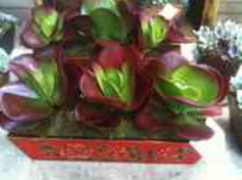
To go along with the Convention, there is a call for table decorations for the banquets.