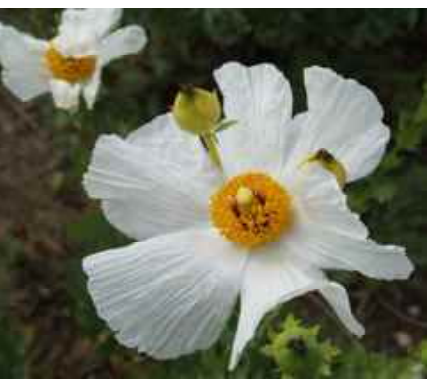
Romneya coulter (Matilija Poppy)