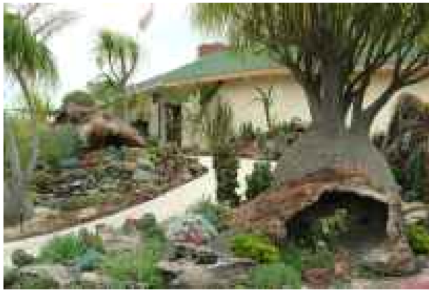
The Ecke Building with Jeff Moore's landscaping.

There will be BRAG PLANTS • EXCHANGE TABLE • RAFFLE !! But no Directors' Meeting. Too hot! ;-)