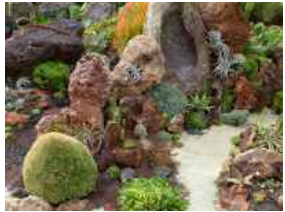
A closeup of Jeff's wonderful work!