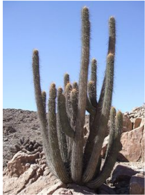
Weberbauerocereus in habitat