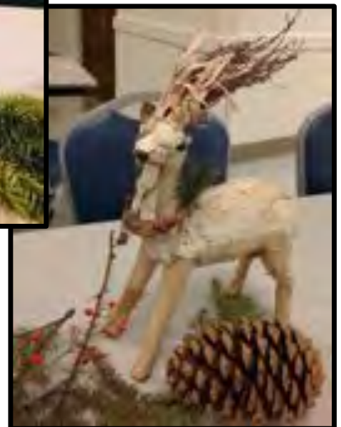
Samples of our delightful centerpieces, reindeer courtesy of Eleanore Voth's collection.