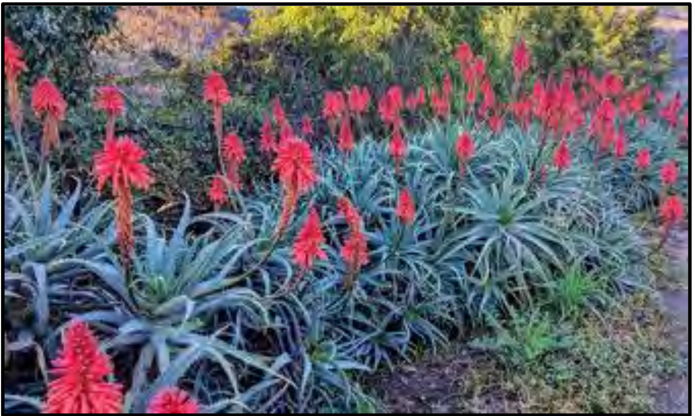
Lorie Johansen's Aloe blue elf - top, David Buffington's Pseudolithos cubiformis in 3.25" pot, and close up of bloom - right