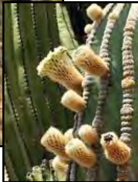
Bottom right - Dudleya