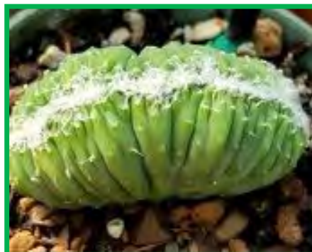
Cereus peruvianus cristata monströse.