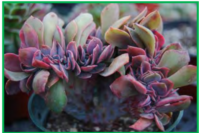
Crested Echeveria 'Perle von Nurnberg'

This month's presentation is about Mutants - Crests, Monstrous, Variegates, and all the oddities of the plant world. The presentation will include a survey of some of the more interesting crests seen in shows and pots as well as crests and monstrous plants seen in habitat and gardens. Cultivation and propagation of these fascinating plants will also be covered.