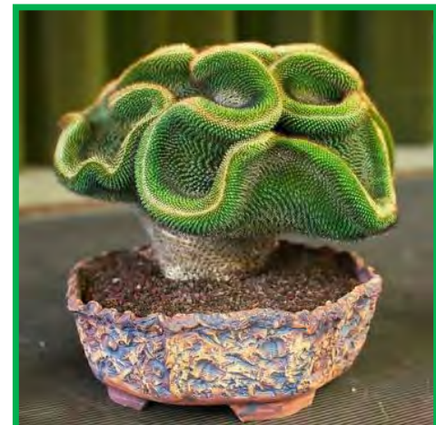
A crested mutation of Austrocylindropuntia subulata 'Eve's Needle'.