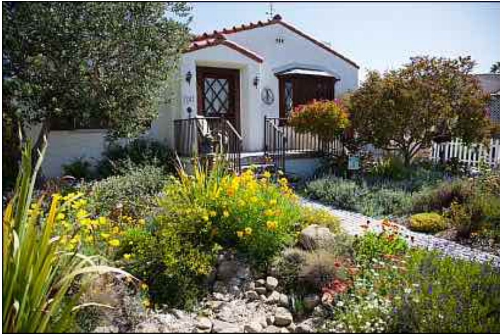
City of Ventura

http://events.r20.constantcontact.com/register/event?oeidk=a07eae425gl09128bee&llr=ybiva8eab