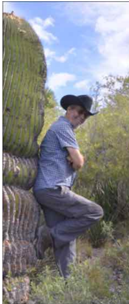
Old Friend Echinocactus platyacanthus