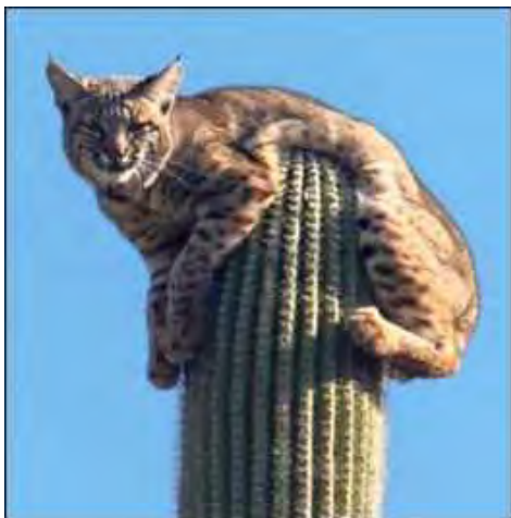
In the Sonoran desert, scratching post scratches you!