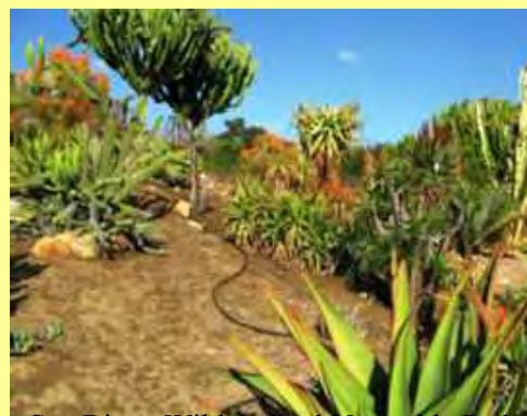
San Diego Wild Animal Vegetable Park