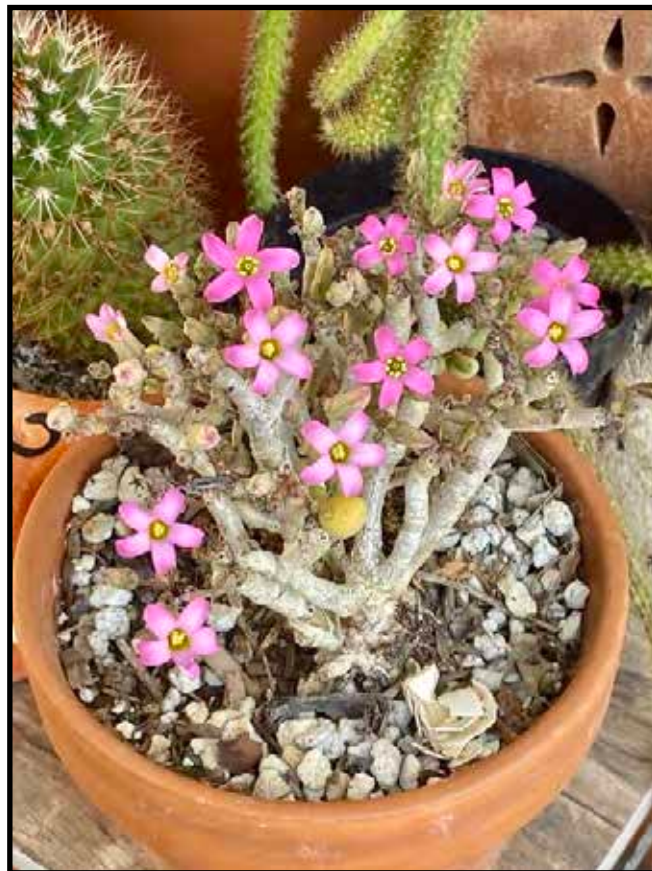
Adromischus filicaulis