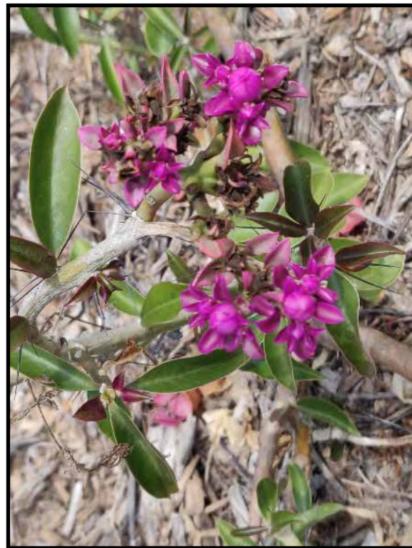
Pereskia sp.