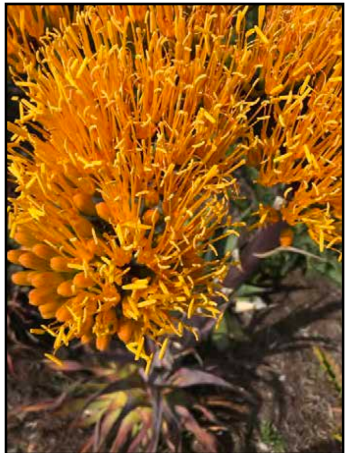
Agave nayaritensis