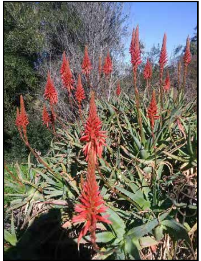
Aloe sp.