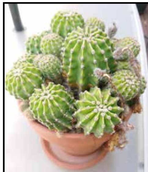
Cactus sp.