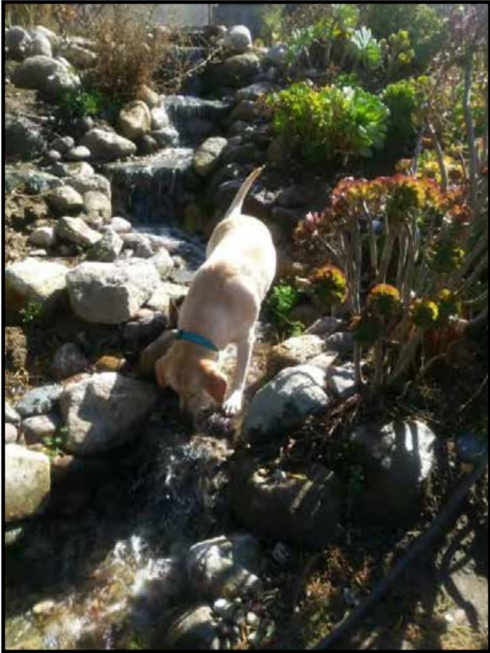
Amber and hand-built pondless waterfall