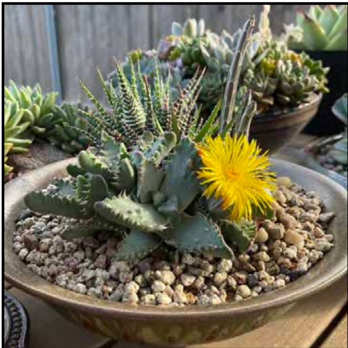
Faucaria tigrina