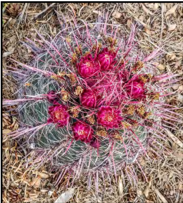
Ferocactus sp.