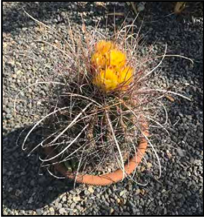
Barrel Cactus