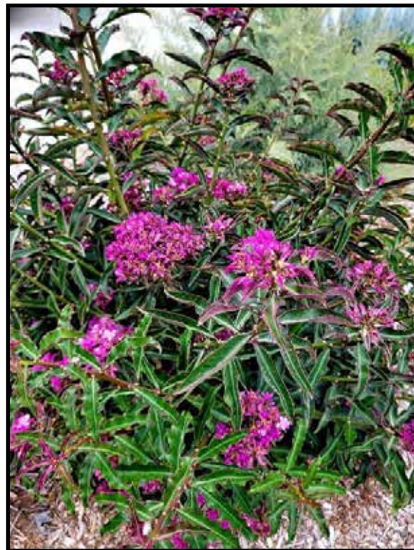
Pereskia sp.

Pereskia are not difficult-to-grow plants and can be grown where temperatures allow. They love light and the sun especially during the flowering phase. The ideal is to place them in a position where they receive the sun, but not in the hottest hours of the day which could burn the leaves. They have no major problems with maximum temperature, but the minimum must not drop below 40 degrees. During the spring-summer period, irrigation ought to be generous, but without leaving the soil soaked. It is also important that it is dry on the surface before proceeding with subsequent irrigation. During the autumn-winter period the irrigations must be reduced to the point of having the soil almost dry. As with most cacti, they can be ignored and still flourish.