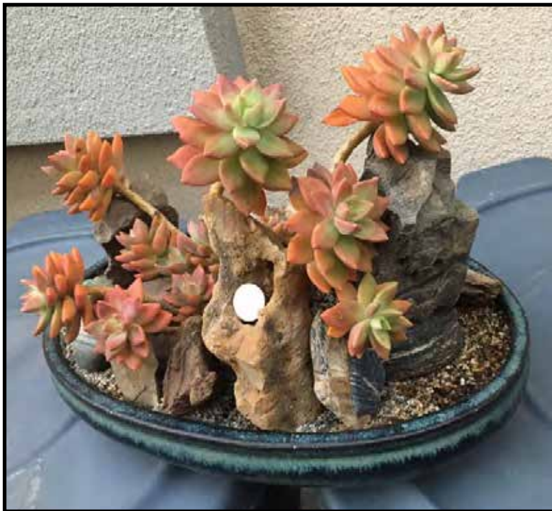
Graptosedum 'California Sunset'