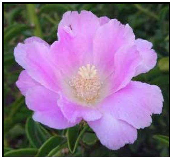
Pereskia sp.