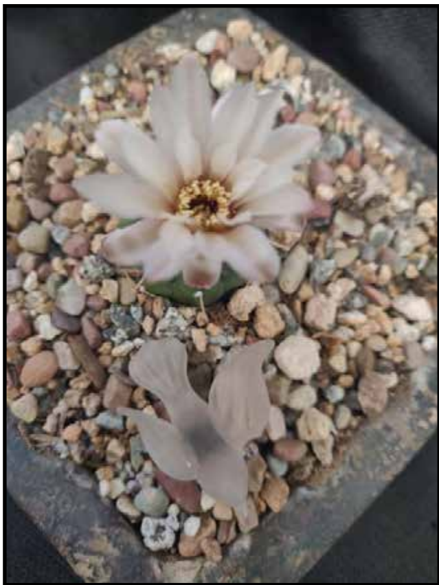
Gymnocalycium sp.