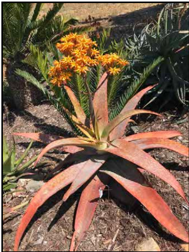
Aloe buhrii