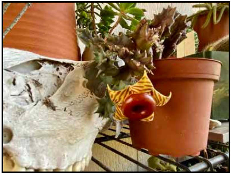
Huernia reticulata