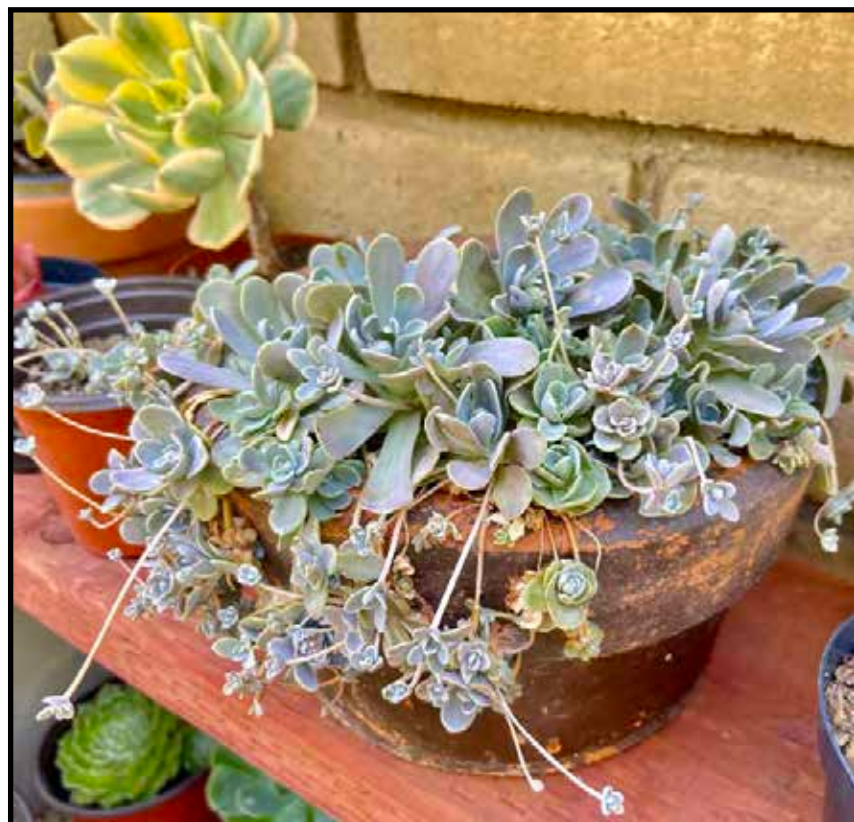
Orostachys furusei