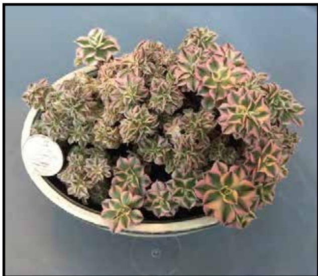
Aeonium decorum 'Sunburst'