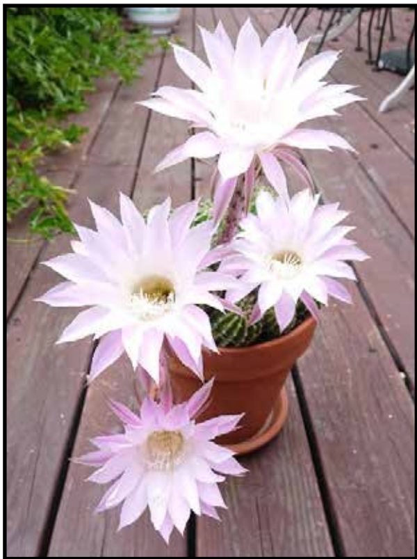
Cactus sp.