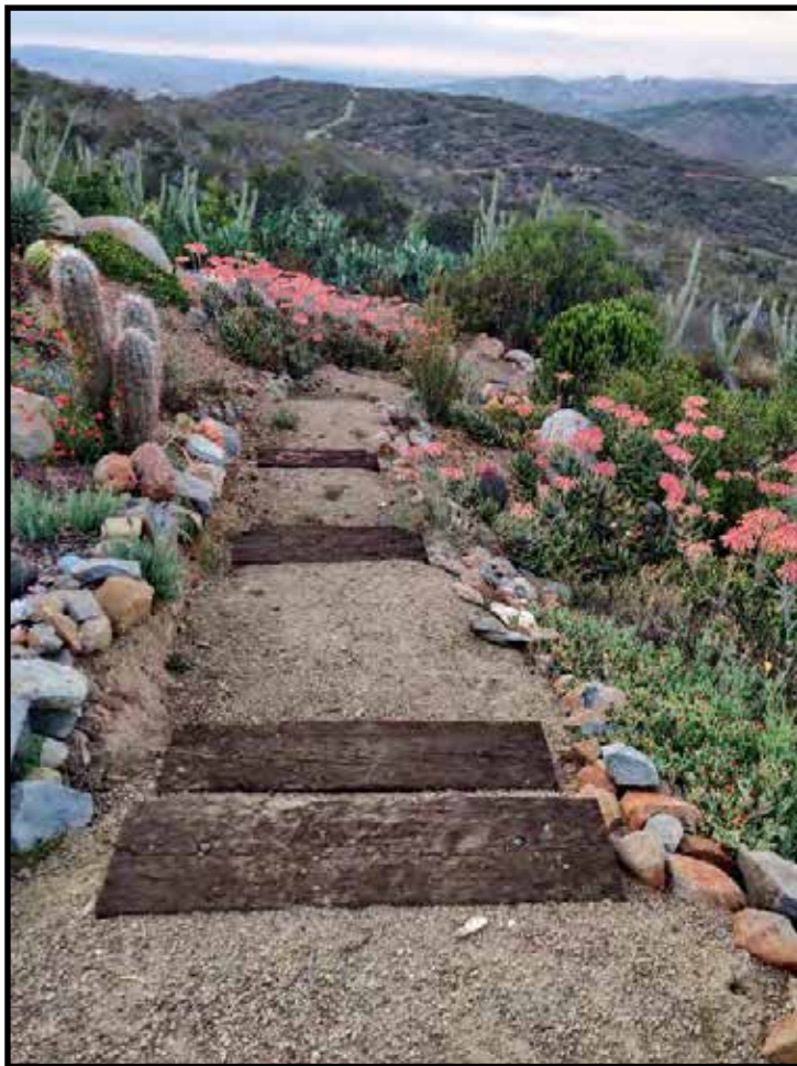
Aloes & Cacti