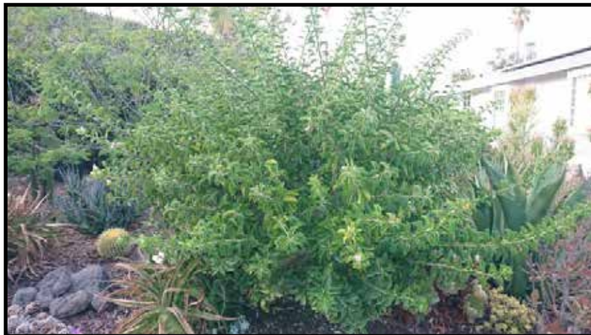
Pereskia sp.

Pereskia, a small tropical genus native to the Caribbean, Central America, and South America, is named after Nicolas-Claude Fabri de Peiresc, a 16 th -century botanist. Unusual among cactus, Pereskia species have broad leaves and long stems. Scientists believe that the original cacti were like Pereskia in this regard and that other cacti lost their leaves as an adaptation first to epiphytic conditions and then to dry conditions. Pereskia is a cactus genus that is most unlike all other members of the family. Other than the defining characteristic of spine-bearing areoles and some floral characteristics, this genus does not resemble most cacti.