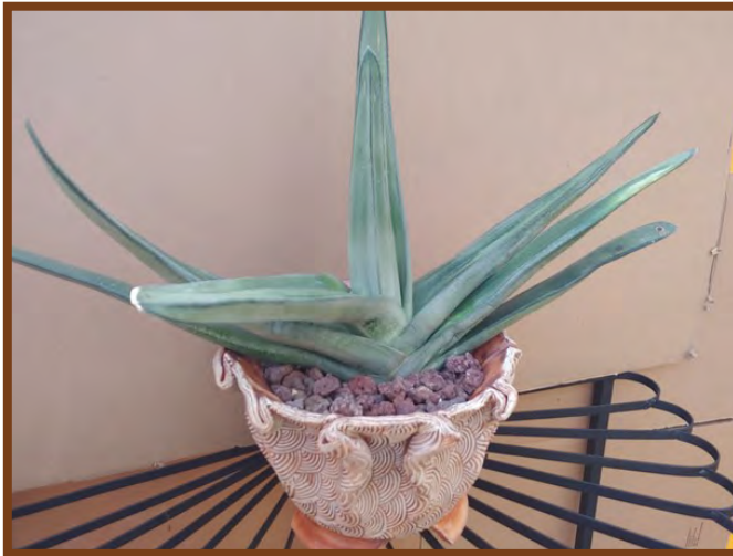
Gary Vincent's Gasteria Blue Ox