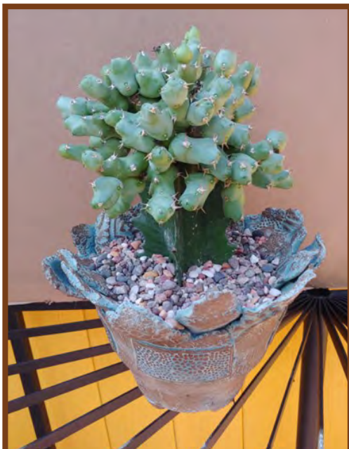
Wanda Mallen's Euphorbia clivicola