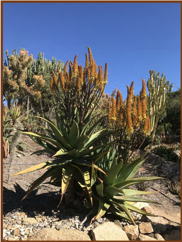
From May-Fong Ho: A huge aloe hybrid at Old World Succulent Garden, Safari Park