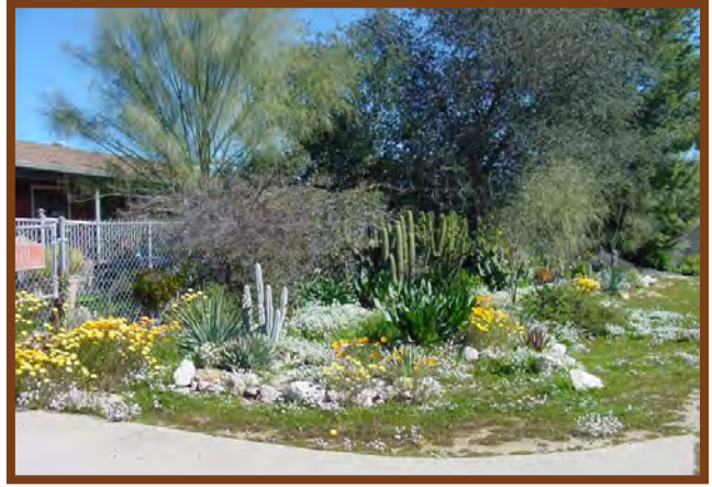
Deborah Pearson's Garden