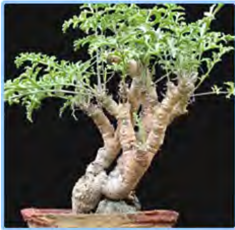
The scented leaves of some pelargoniums are thought to have antiseptic qualities.

These winter growers should be shaded in their summer dormancy (as in habitat). When leaves appear as temperatures drop, start watering and fertilizing. Let dry out in between waterings which mimics the growing season in South Africa. One grower likes to use tomato fertilizers (1/4 strength twice a month). Flowers start this month. We look forward to enjoying a few flowers and interesting caudex shapes on the brag table this month.