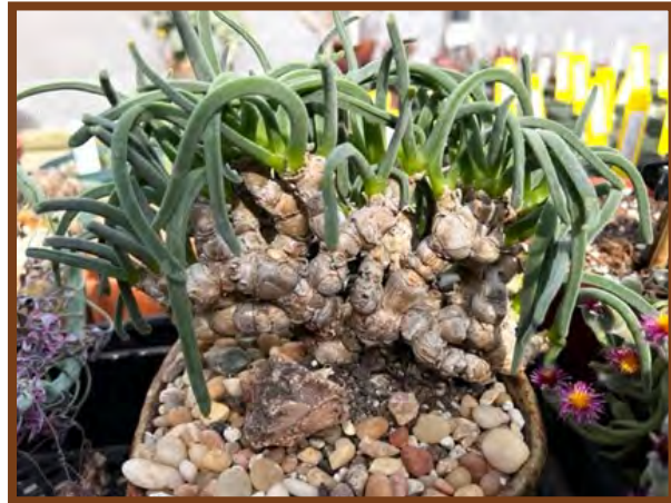
↖ Tina Zucker's Monilaria moniliformis ↙ Euphorbia supernans