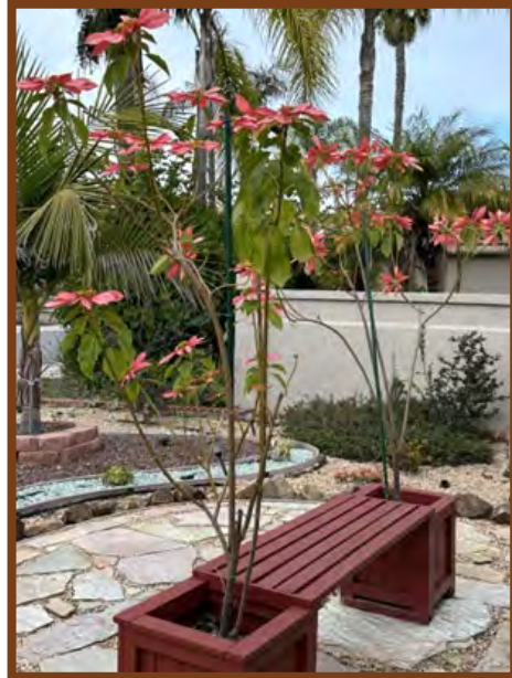
Charlyne Barad's Cane Poinsettia (Cuttings from PCSS exchange table.)