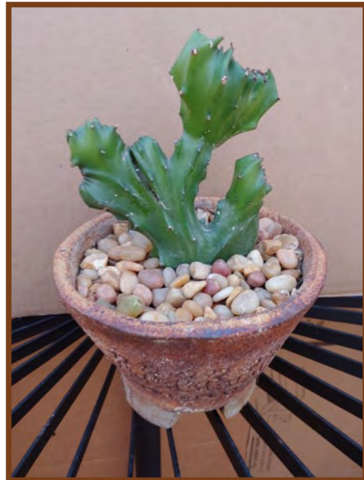
Wanda Mallen's Euphorbia antiquorum crest