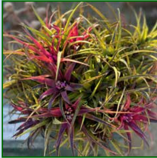
Tina Zucker's Bromeliad neorgelia purple