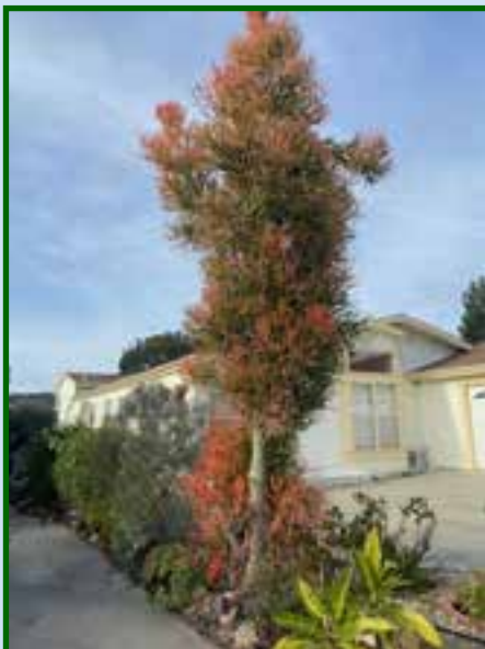
Moni Waiblinger's Euphorbia tirucalli 'Sticks on Fire'