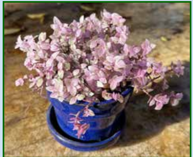
Jamaye Despaigne's Tradescantia 'Pink Panther'