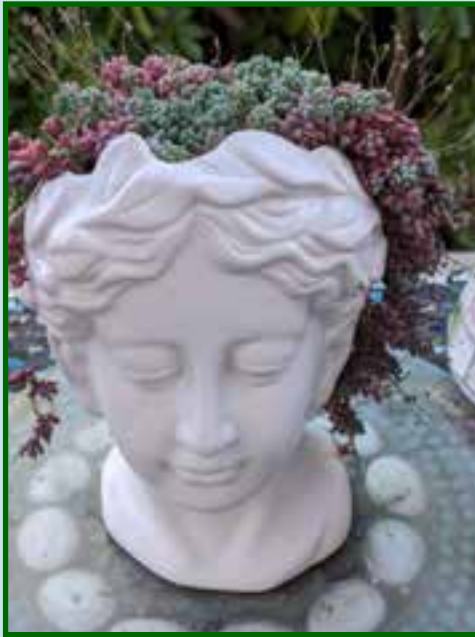
Sedum dasyphyllum 'Lilac Mound'