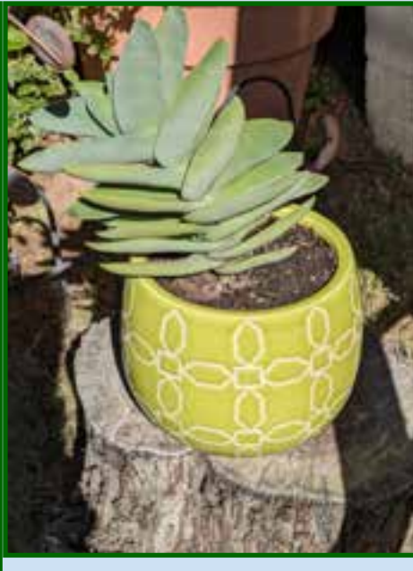
Sherry Hunga-Moore Crassula falcata 'Helicopter Plant'