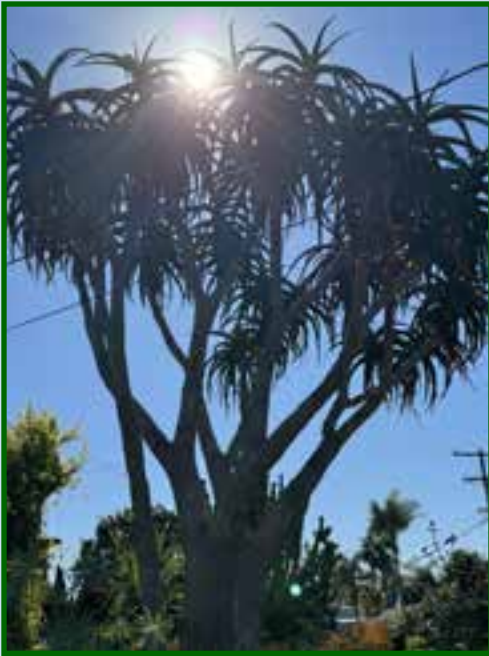
Tina Zucker's Aloe barberae