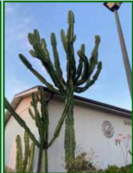
Moni Waiblinger's Euphorbia 'Candelabra'