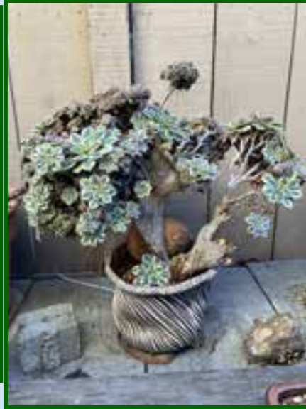
Pauline Wong's Crested Aeonium decorum 'Sunburst'