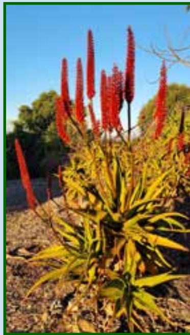
Aloe 'Erick the Red'