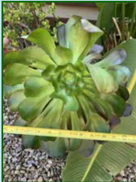
From Stacy Day