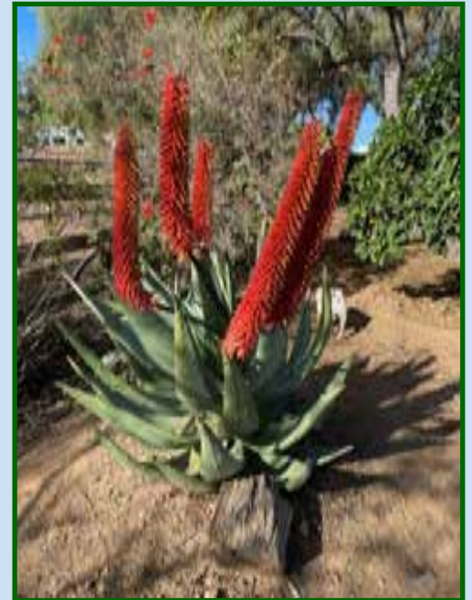
Sherman Blench's Aloe ferox