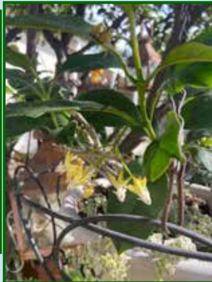
Moni Waiblinger's Hoya 'Shooting Star'