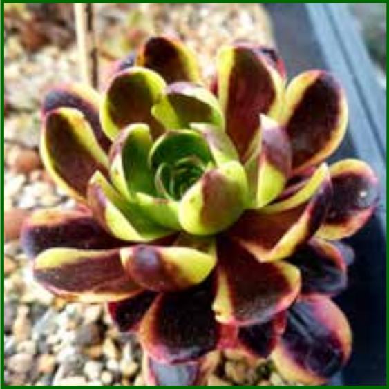
Aeonium 'Super Bang'

Aeonium consists of approximately 35 species of small to medium-sized subtropical succulents in the Crassulaceae family native to parts of northern Africa, Canary Islands, Cape Verde Islands and Madeira. These plants are grown primarily for their attractive rosettes of waxy leaves which may be solid green, green variegated with creamy yellow, bronzy-purple, or dark purple. Mature plants of A. arboretum and related hybrids grow about 3 feet tall. As the plants grow new leaves, older leaves eventually die and fall off, leaving a clump of leaves at the end of naked stems on old plants. Other species, such as A. tabuliforme and A. smithii do not develop long stems and always remain compact. Other species of Aeonium vary in size (ranging in height from 1½ to 6 feet), branching pattern, and color.