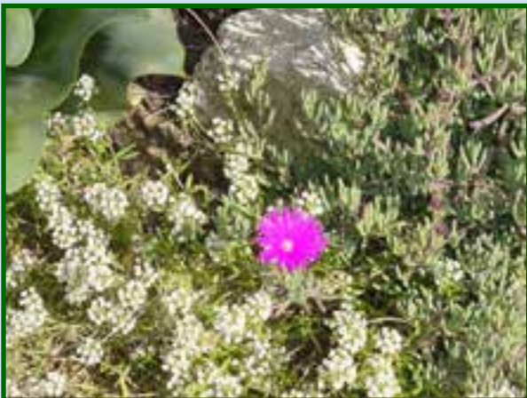
'Crown of Thorns'