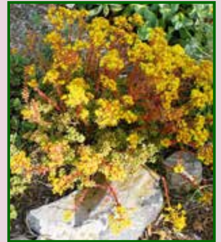
Aeonium 'Irish Bouquet'

Cricket and grasshopper damage are possible throughout the warmer months. These chewing insects generally cause minor damage, eating the outer leaves and making the plants look unsightly. If the problem is severe, a systemic insecticide for chewing insects could be used but the damage may still occur before the insect has succumbed to the effects of the insecticide.