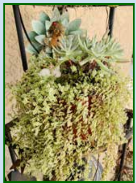
Sedum 'Little Missy' and Dudleya