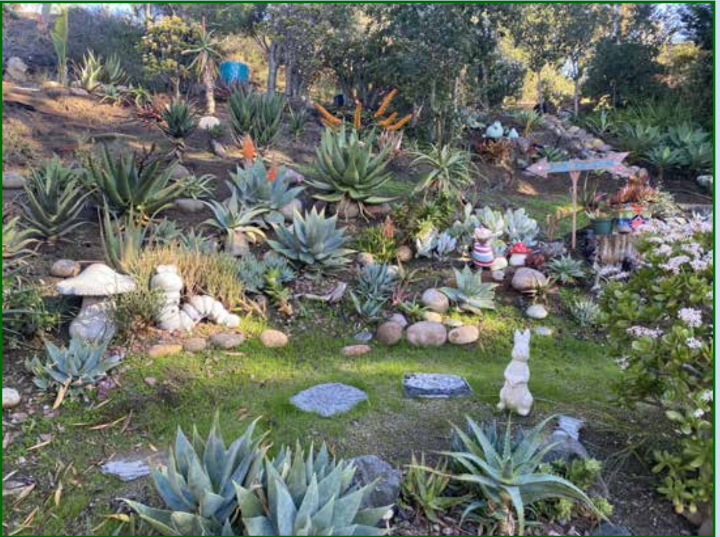
Terrell Barnhart's "Aloes in Wonderland"