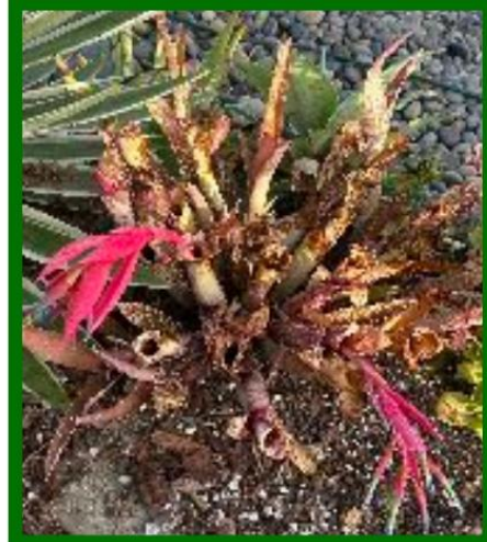
Bilbergia distachia (bromeliad)