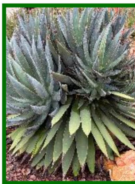
Agave 'Blue Glow' Charlyne Barad