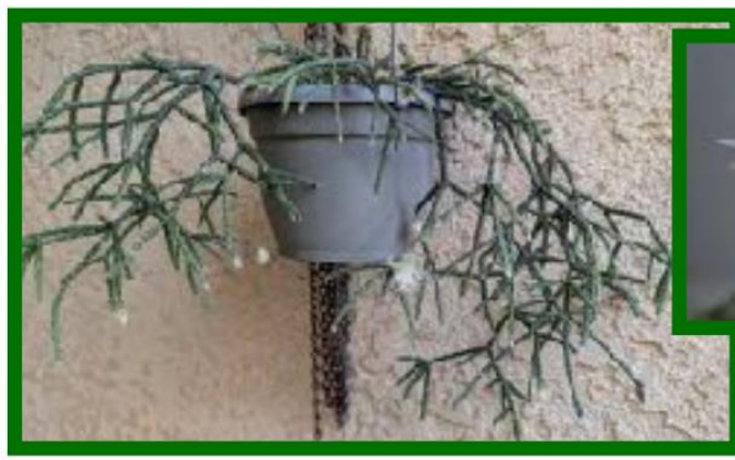
Rhipsalis pilocarpa Lois Walag