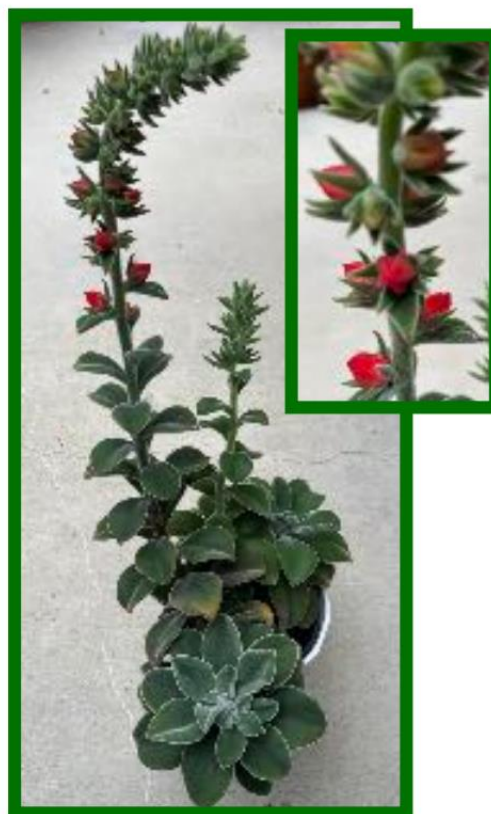
Echeveria pulvinata