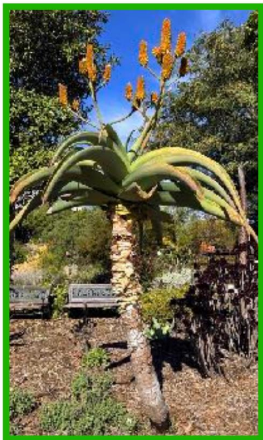
Aloe thraskii