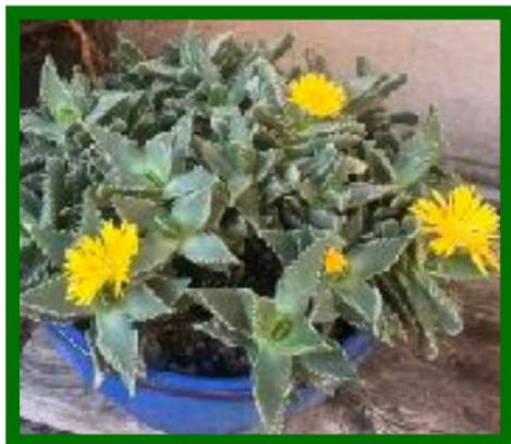
Faucaria tigrina Pauline Lien Wong

Share an especially nice section of your garden, a plant that bloomed in between meetings, or one that is too large to bring to the Brag Table. Earn 2 points for each published photo. (Point amounts for the Brag Table winners and Garden Brag will be changing in February.) You may send in photos of a maximum of two plants. Send submissions to: jmherskowitz@yahoo.com . SUBMISSION DATES IN 2026: 1st day of each month.