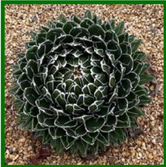
Agave victoriae reginae