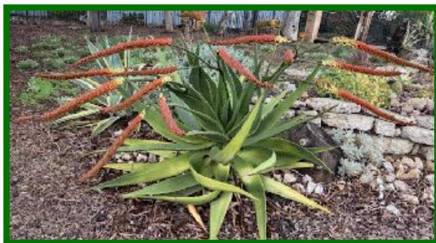
Aloe hybrid Sherman Blench