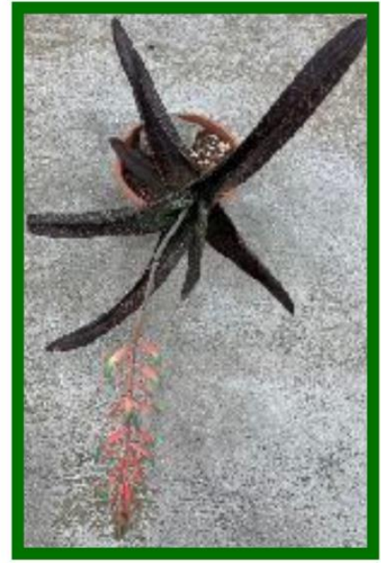
Gasteria acinacifolia