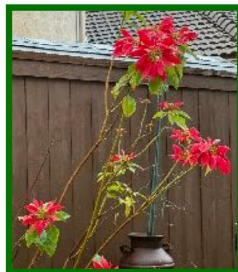
Euphorbia heterophylla Charlyne Barad