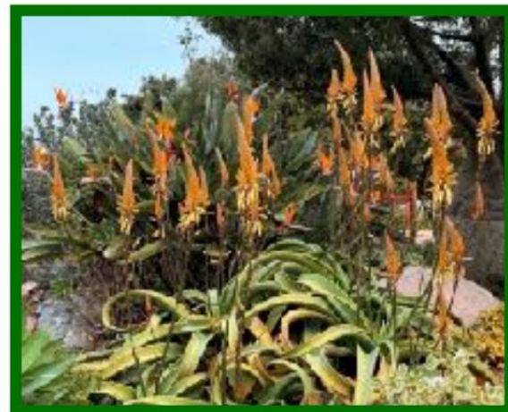
Aloe vanbalenii