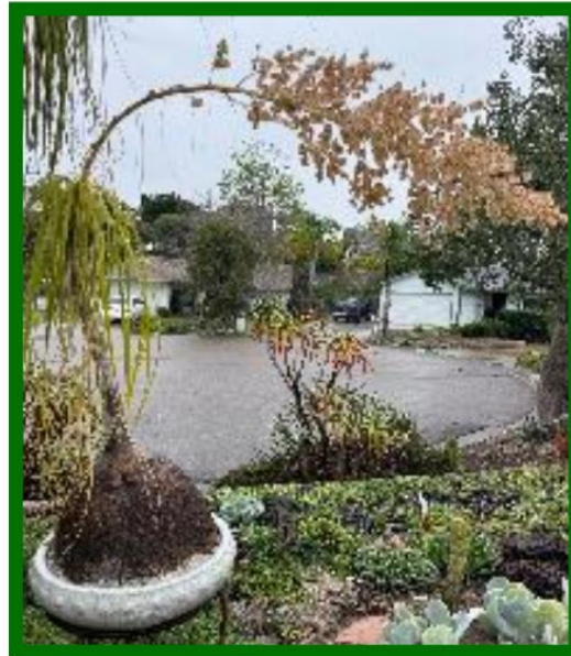
Beaucarnia recurvata