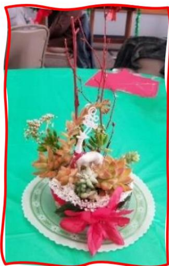
Charlyne's festive table decorations.