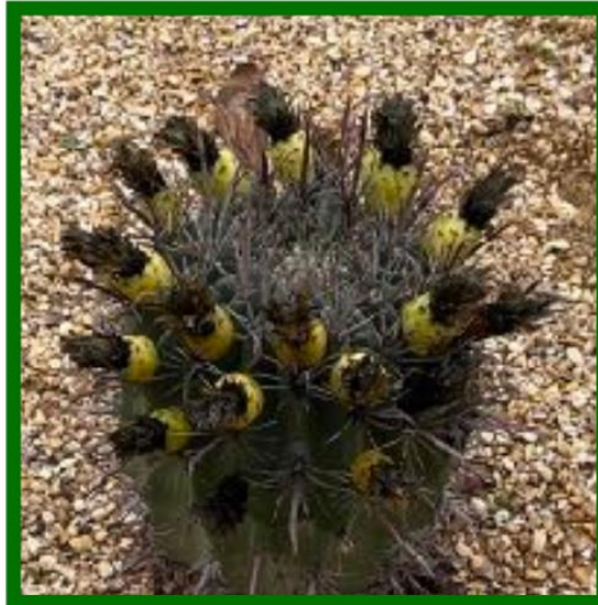
Ferocactus wislizeni