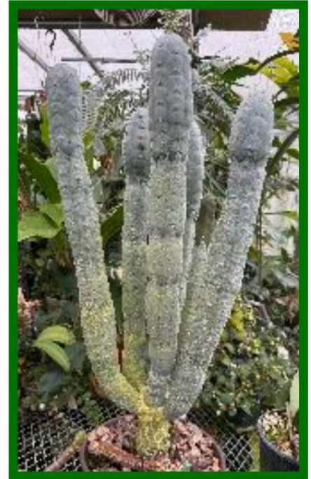
Euphorbia abdelkuri