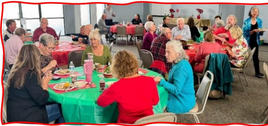
Members enjoyed the feast and each other's company.