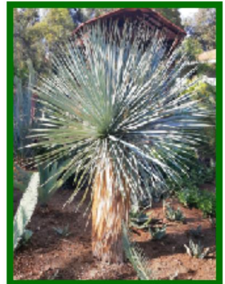
Yucca rostrata