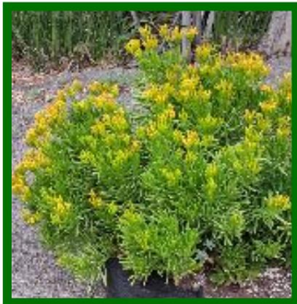
Senecio barbertonicus (top) Crassula ovata (right) Lottie Foster