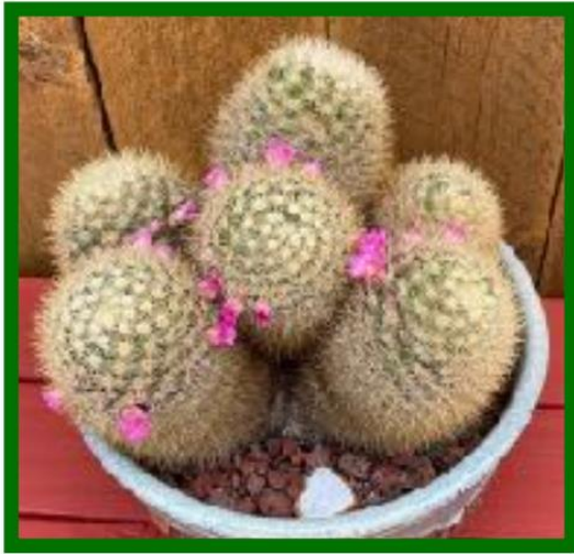
Mammillaria laudii subducta