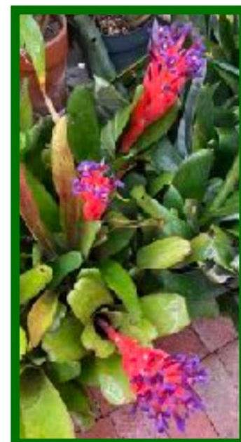
Aechmea hybrid (bromeliad)