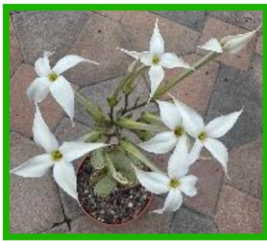
Kalanchoe marmorata Jamie Straub