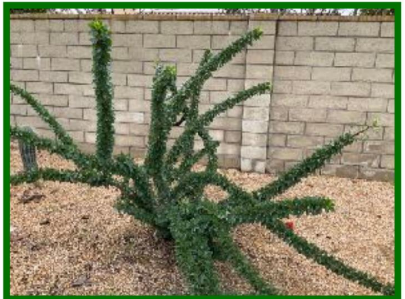
Fouquieria macdougalii