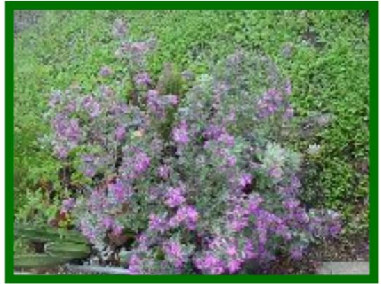
Leucophyllum frutescens (Texas Ranger) Deborah Pearson