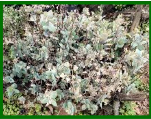
Kalanchoe fedtschenkoi